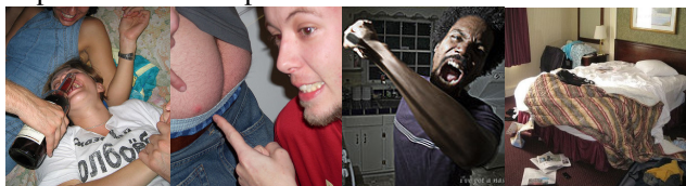
Figure 7. Photos characterizing "Provocative" cluster (Alcohol 4, pimples 4, angry 4, bed 4)

This cluster gathers a very masculine part of our sample (Table 2). They are mostly undergraduates and with vocational education. But there are no clear differentiations among ages. The average network size here is the most important in the sample with 118 friends.