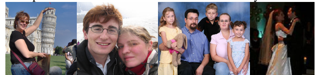
Fig. 4. Photos characterizing "Traditional self-exhibition" (vacancy 4, Couple 2, Family 4, Wedding 4)

Traditional self-exhibition (24.1%) is the usual way of displaying one's private life: photos of family, vacation, wedding; or preferences such as which teams one roots for (Fig. 4). This type of exhibition appeared in the end of nineteenth century as a way to make public family life and has been strongly conventionalized through ritualized genre such as family, holidays or wedding representations. In this cluster, people are not reluctant to public exhibition, but they are also not familiar with individual self-presentation. They present themselves with their family (we observe a very strong resistance of younger people to show their parents on SNS). They share their hobbies and their passion with tact and in a conventional way.