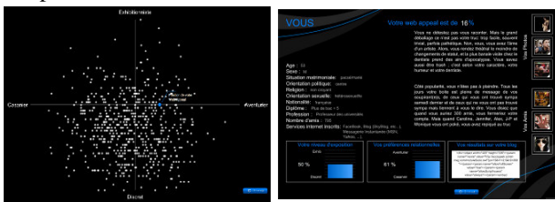
Figure 2. Respondent results at the end of the game

we proposed a set of criteria corresponding each to a specific information to reveal about the 6 hidden profiles and asked the respondents to choose one of them, examine the information posted on each profile and finally to eliminate the one containing the less wanted information. In this way, respondents come to their final choices by eliminating one profile at a time, according to the specific information they had chosen to reveal about profiles. At the end of the game, participants receive their game profile with the photos and the friends they had chosen during the first and the second game. We also gave them their rate of “web appeal” on two axes: discrete/exhibit and stay-at-home/adventurous as well as a chart showing their position among the other respondents (Fig. 2). It should be noticed that these rates are not given as a scientific measurement of users’ on-line behaviors but as an incentive for respondents to play the game till the end and to spread it through blogs for potential users.