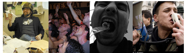
Figure 6. Photos characterizing "Show-off" (Office 4, dance 4, eating 3, demonstration 4)

People belonging to this type are the youngest of our sample (average age of 26 years vs. 28 for the sample). Students are the core population of this cluster in which we find the highest socializing and extraversion indexes. The cluster members also appear more liberal than other groups. They declare no religious affiliations and express leftist political views. Their average network size is 99 friends.