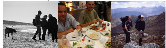
Fig. 3. Photos characterizing "Modest" cluster (Family 1, Eating 1, Vacancy 1)

Modest (18.9% of the sample) cluster represents people with the lowest rate of self-exhibition on each set of photos. They deliberately choose images with a low possibility of person recognition, or very familiar types of self-presentation (Fig. 3). In our sample, there is a strong correlation between age and modesty (Table 2). Female users are dominant. People are older, and have higher levels of education. Senior executives, teachers and researchers are numerous in this cluster. They also have the smallest network size with a mean of 71 friends on their most used SNS platform.